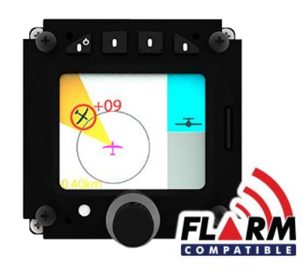
Figure 4 External FLARM Displays