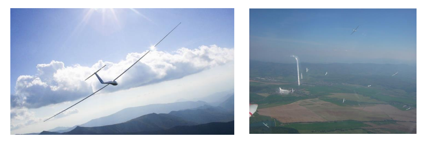
Figure 2 Glider Silhouettes

In Germany we have about 7100 gliders registered. Very often gliders fly in clusters when gaining altitude in thermals. For the fast flying flight inspection aircraft gliders and other traffic without transponders must be considered a severe hazard.