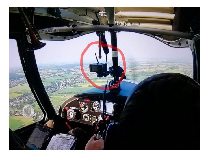
Figure 5 Typical FLARM Installations in Small Aircraft