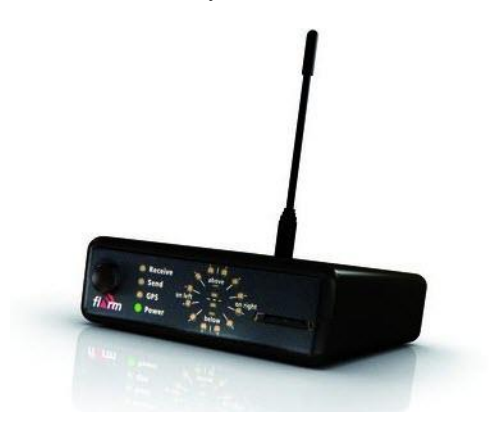
Figure 3 Classic FLARM

After a significant number of tragic glider midair collisions the low cost collision avoidance system FLARM (FLight alARM) has been invented in the year 2004 by a group of pilots and engineers. The aim was to have a huge number of gliders equipped with the affordable compact and easy to install FLARM system.