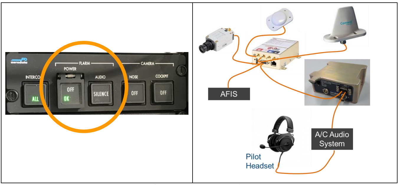
Figure 7 FLARM Installation

The control switches in the cockpit allow to power on/off the FLARM, provide FAIL indication and allow to suppress FLARM aural warnings while keeping the FLARM active, so that the flight inspection aircraft remains visible to other FLARM receivers.