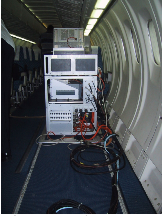
Supplements to flight manual and maintenance manual

A special cable-set is connected before each calibration campaign between the bench and the junction panel. It is fixed on the aircraft's floor.