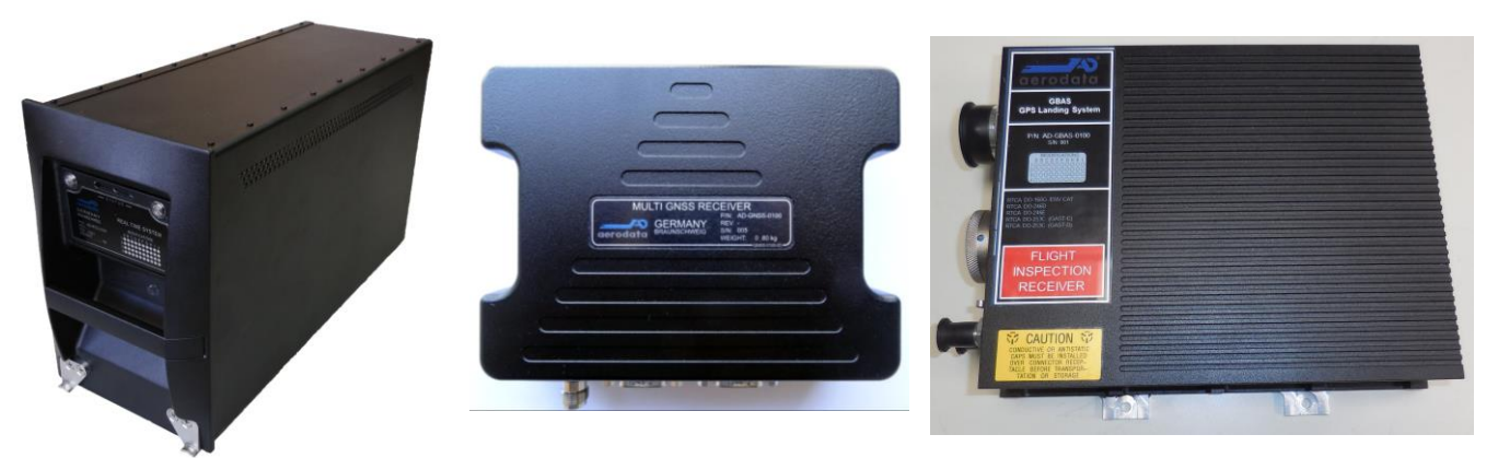
Figure 3: GAST-D FIS demonstrator components (from left to right): real-time computer AD-RTS-0100, GNSS receiver AD-GNSS-0100, GBAS receiver AD-GBAS-0100

VDB ground stations transmit messages in 8 different time slots in 2 frames per seconds. This means, messages should arrive at the GBAS receiver at a 16 Hz data rate. The Linux based AD-RTS-0100 real-time computer is able to operate at a data rate of up to 100 Hz and thus allows the accurate recording and processing of the GBAS data provided by the receiver.